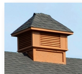
Handmade cedar cupola