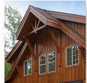
Front gable end, may vary by package