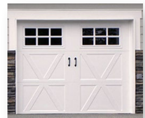
Optional garage door packages available