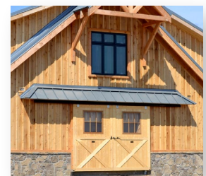
Front entry awning