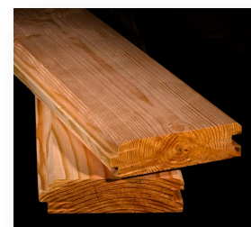
Pacific Northwest Doug Fir