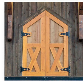
Pre-built faux hayloft doors, may vary by model

Note: windows provided with kit are Jeld-Wen (vinyl) in Desert Sand unless otherwise noted.