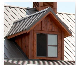
Multiple dormer packages available